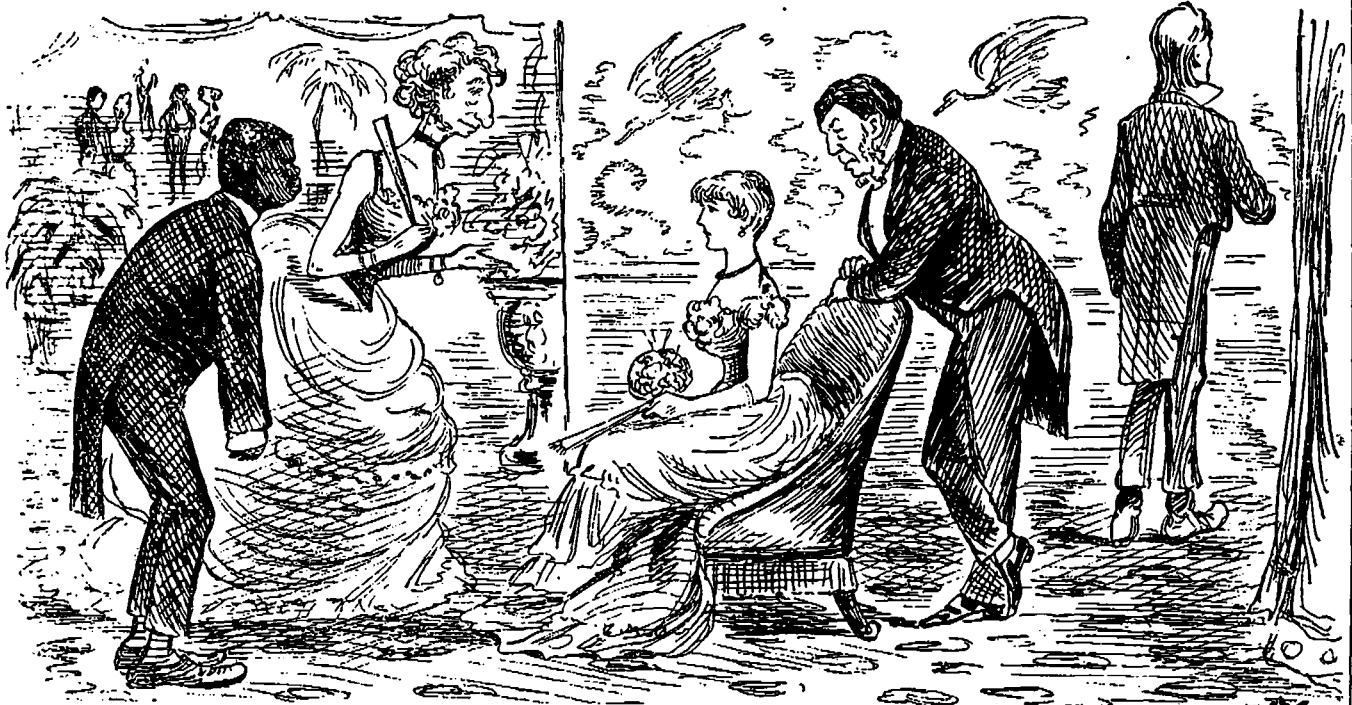
THE JAMAICA QUESTION.

Lady Sirjonne.—PERMIT ME, MISS CANADA, TO PRESENT MY YOUNG FRIEND MR. JAMAICA GINGER, WHO IS EAGERLY ANTICIPATING THE PLEASURE OF A HIGH TARIFF WALTZ WITH YOU. Miss Canada.—THANKS, MY LADY, NO; MY PROGRAMME IS QUITE FULL.