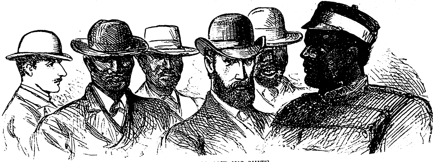
CETEWAYO AND HIS SUITE.