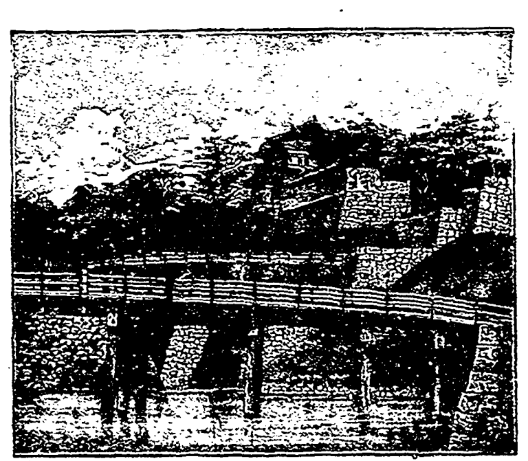
THIRD NOLT OF THE TOKYO CASTLE

"T? ere is something very inspiring in the lively notes of the bugle that make the eatire place vocal in the morning. at noon, and at sundown. It contains a garrieon of about a thousand men. They are dressed in blue uniform trimmed with yellow, and are armed with Sayder and Sharpe rifles. These soldiers come from the provinces. They are small men, but very plucky and bardy They are kept under excellent discipline. It is a rare thing to find one of them drunk." As there are about one bandred and fifty of these castles scattered throughout Japan, some hint as to their construction, which is always on the same general plan, may prove of interest. We quote from Mr. Maclay: