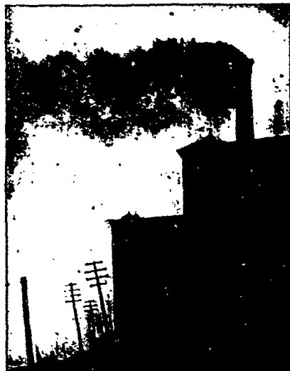
Photograph of a Chimney BEFORE the American Stoker was installed.