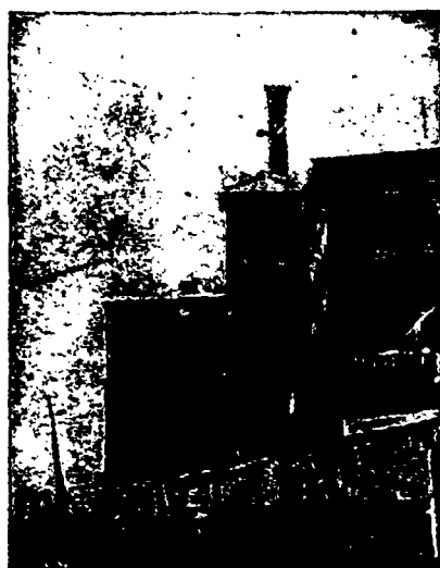
The same THE ... Chimney AFTER American stoker was installed.