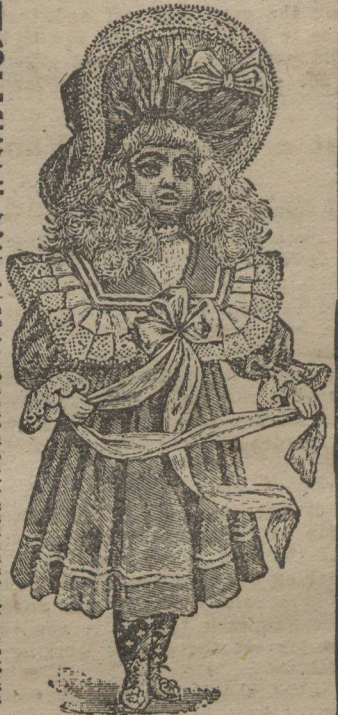
Alice in Wonderland

Remember, you will receive the two dolls , Cinderella and Alice in Wonderland, for disposing of only sixteen collars at 15c each. The Home Art Co., Dept. 433 Toronto.