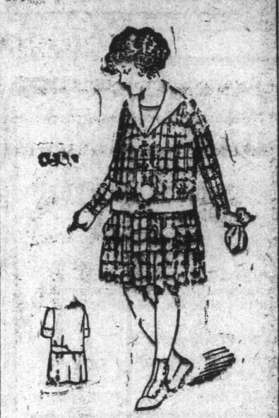
A POPULAR ONE PIECE STYLE.

The Home Dressmaker should keep a Catalogue Scrap Book of our Fashion Plates. These will be found very useful to refer to from time to time.