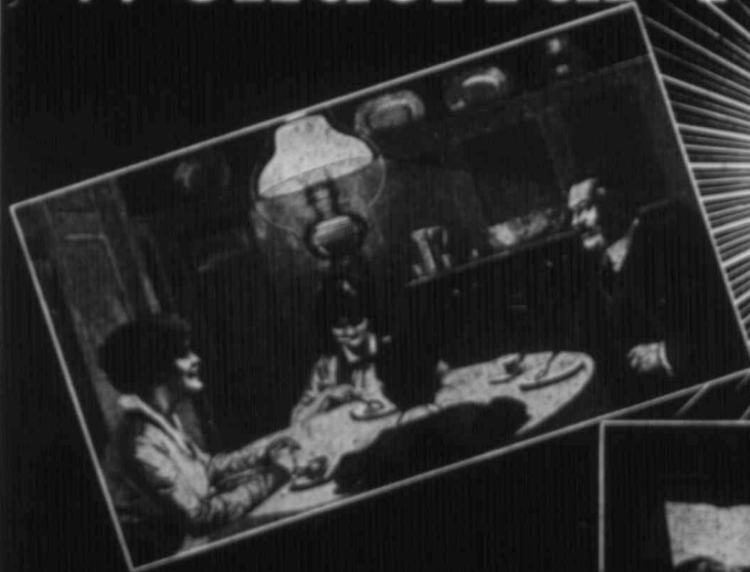
Beats Gasoline or Electricity