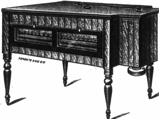
This cut represents our 240-eggs capacity improved