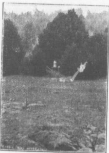
A Desirable Location for a Milk Stand

On being put to vote it was decided to hold the next convention in Perth on Jan. 6, 7 and 8. The directors decided that they could not fetter the next board of directors in