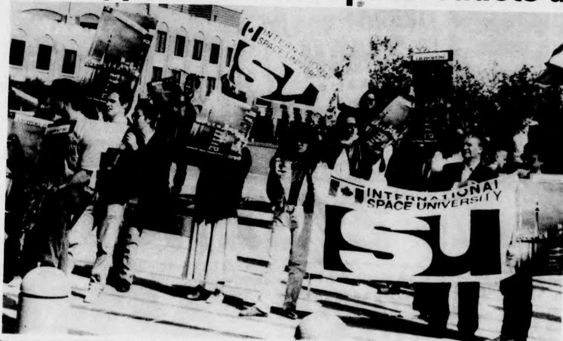
Students, faculty at Sept. 24 rally in front of Vari Hall supporting an Ontario government-based bid to bring a space university to York's main campus.

At the briefing, opponents appeared irrational and paranoid. Every