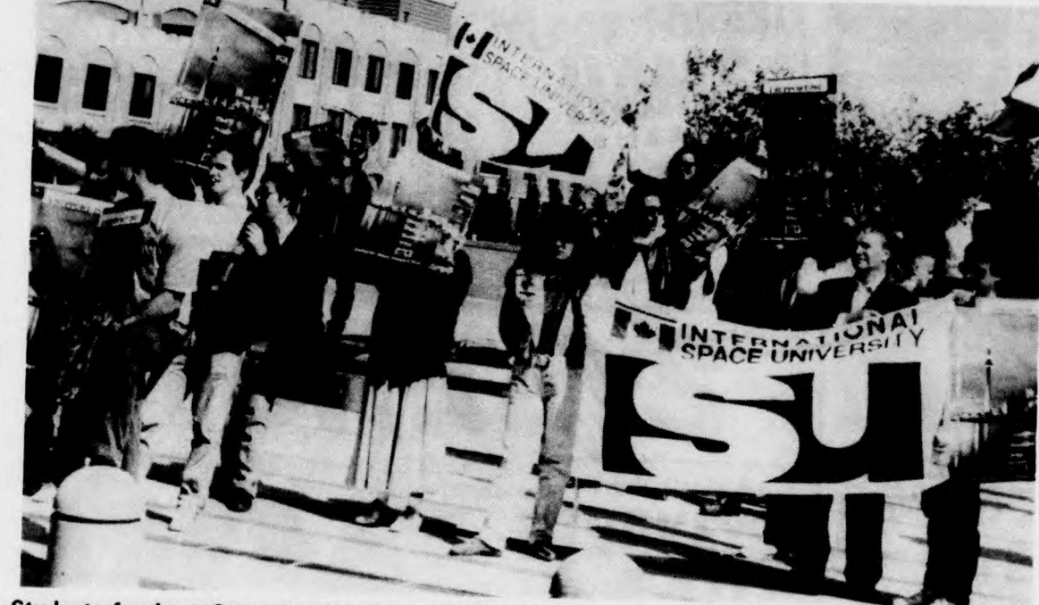
Students, faculty at Sept. 24 rally in front of Vari Hall supporting an Ontario government-based bid to bring a space university to York's main campus.

At the briefing, opponents appeared irrational and paranoid. Every