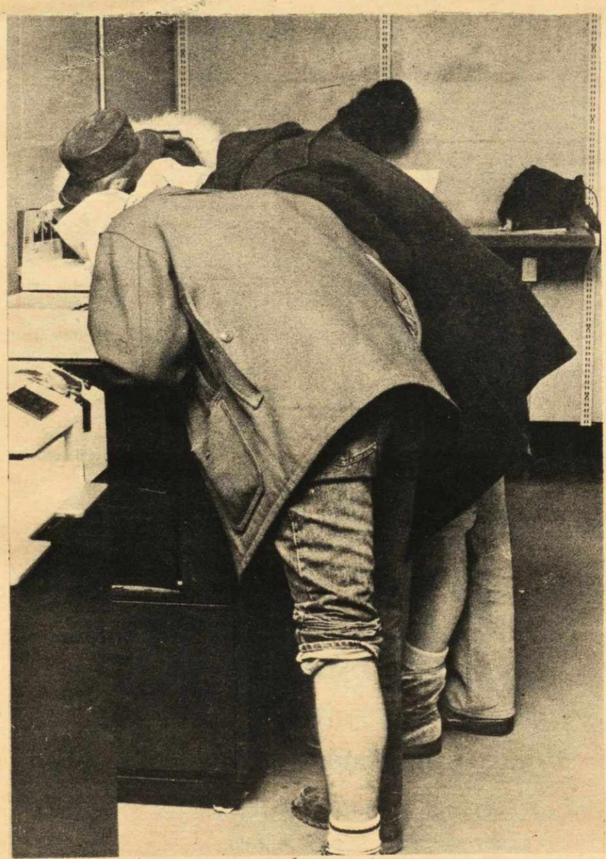
The Student Union elections race is on! Candidates vie for exposure.

There is money at the Student Awards Office and the University is anxious to give it away. Ontario Loan Certificates, New Brunswick Loan Certificate, Nova Scotia Bursary Checks, and New Brunswick Bursary Checks are just collecting dust in the office. So all you students who haven't already picked them up, don't give the administration the impression that you don't need the money. But remember to bring them your green sheets. The money is there so get it!