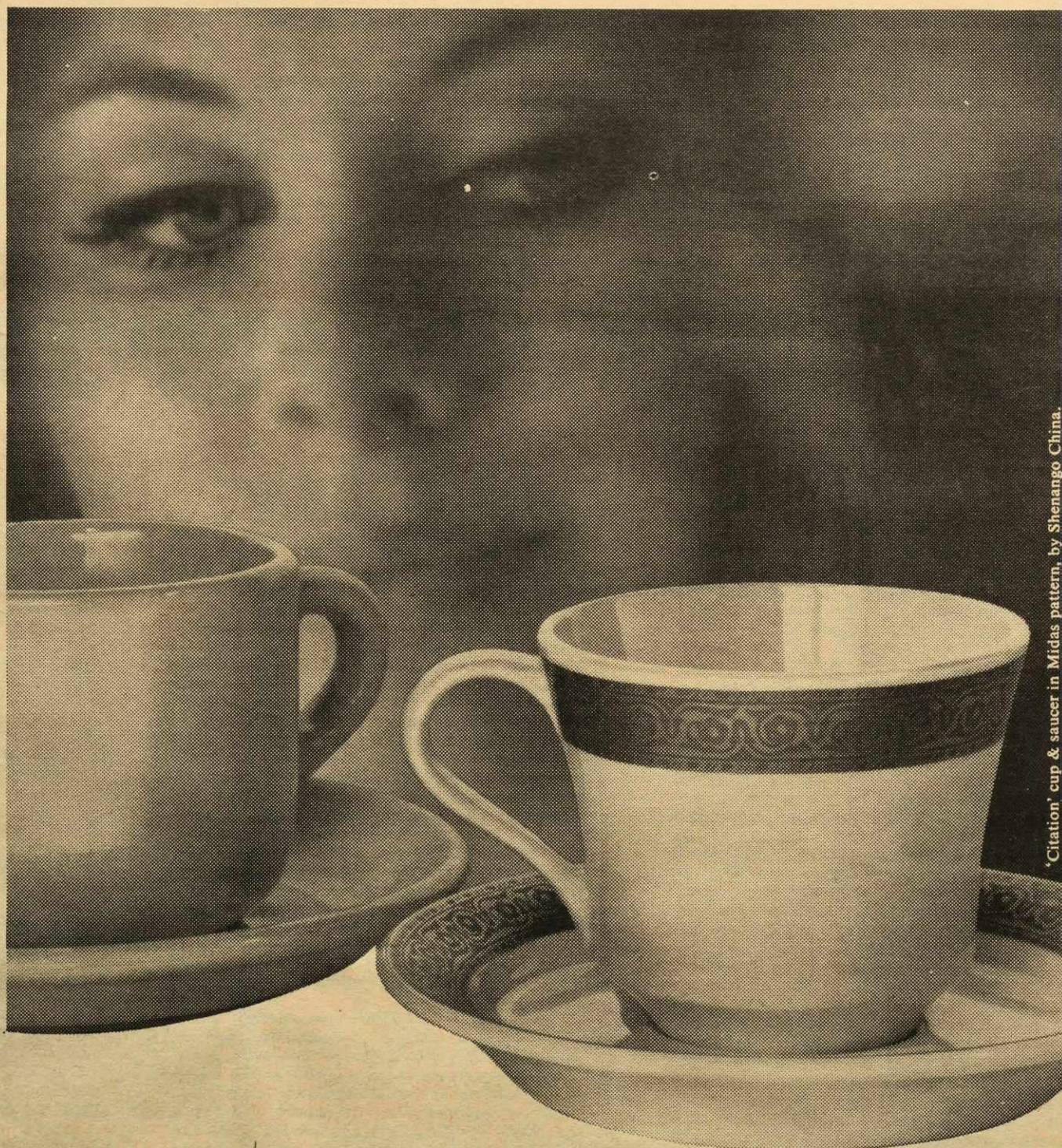
'Citation' cup & saucer in Midas pattern, by Shenango China.

According to company recruiters, response of top students to Dow campus interviews has not been affected, despite the more than 180 demonstrations in the last year.