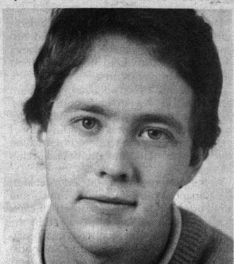
ensures fresh ideas and enthusiasm on the