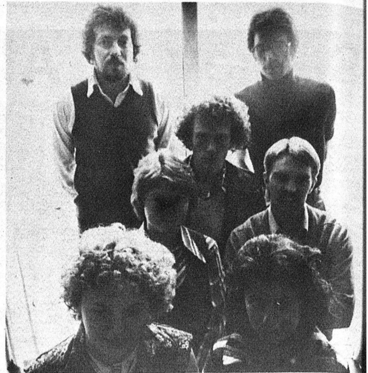
The Hire-A-Student staff.