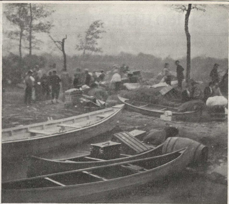
Refugees on the beach at Golden City in the midst of fire on July 11.