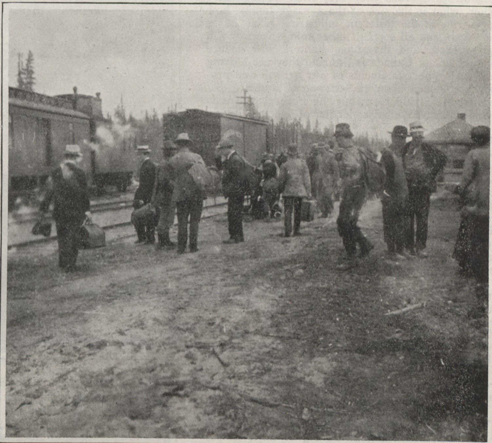
Fire fugitives from Porcupine and Cochrane changing trains at Kelso on July 12.