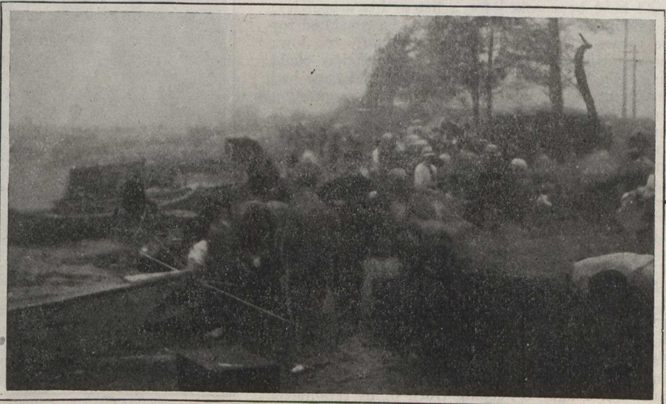
A huddle of Humanity at the water's edge in Golden City.