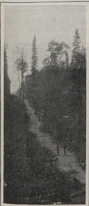
Corduoy death trail, Porcupine to Hollinger and Dome Mines.