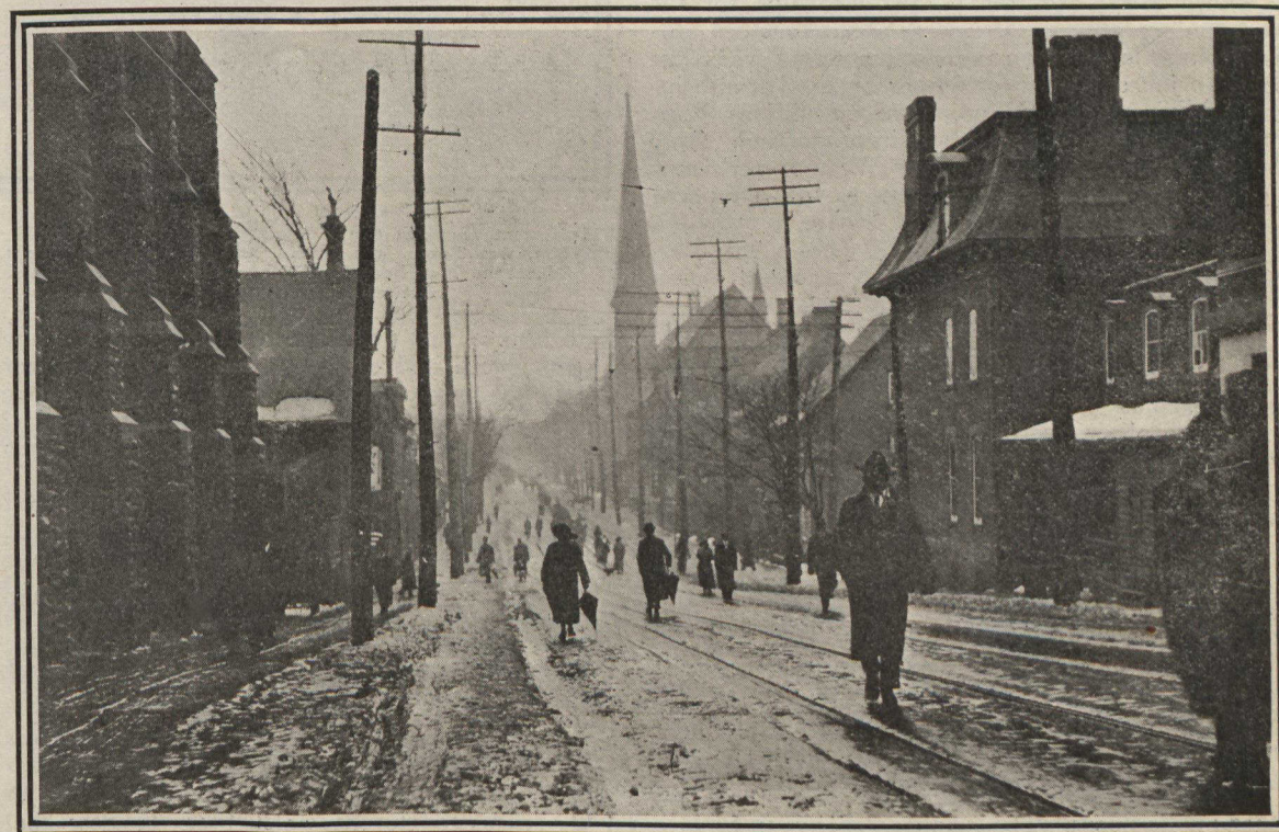
Ottawa During the Parliamentary Session is Always Interesting and at This Time of Year its Streets are Usually Decorated With Two or Three Feet of Snow. Like All Other Eastern Canada Cities There Has Been Little Snow This Year But Plenty of Sleet. This Picture Shows Elgin Street in Such a Slippery Condition That Pedestrians Have Abandoned the Sidewalks and Taken to the Car Tracks.