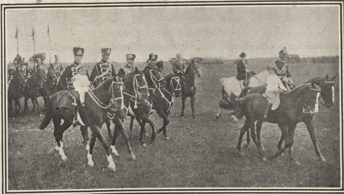
This Striking Picture Illustrates the Military Spirit of Germany and also the Family Pride of the German Rulers. The German Crown Prince is Here Seen Riding at the Head of his Famous Deaths Head Hussars With His Second Son on the pommel of His Saddle. His eldest son, Prince Wilhelm, is Also Seen on a Polo Pony..