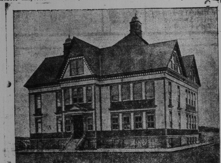
THE CONSOLIDATED SCHOOL AT KINGSTON

Institution at Kinoston-The Work Well Under Way-Institution at Kingston--The Work Well Under Way--Speeches by Prominent Men Interested in Education.