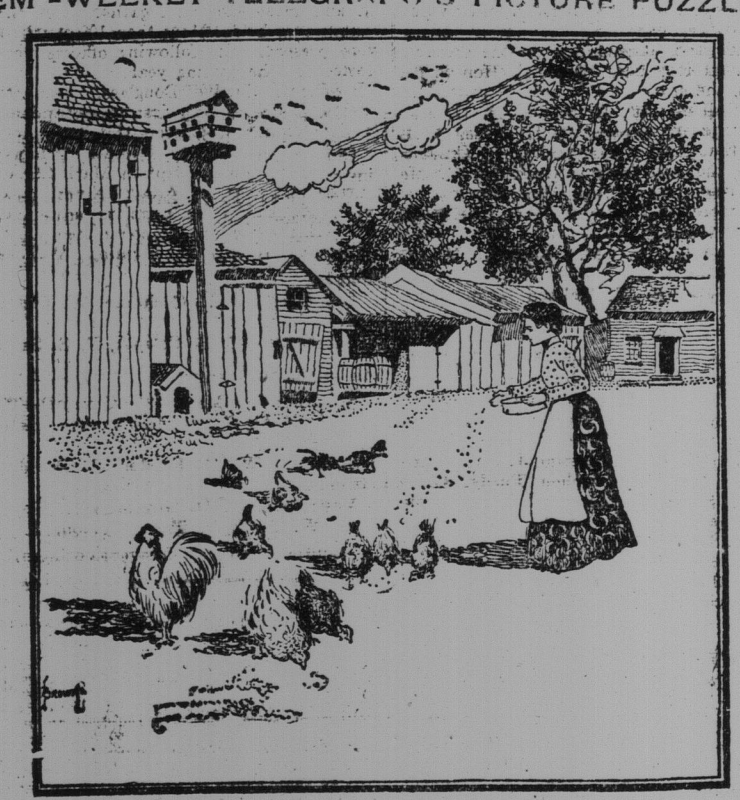
"HENRY BRING SOME MORE CORN." WHERE IS HE? *52