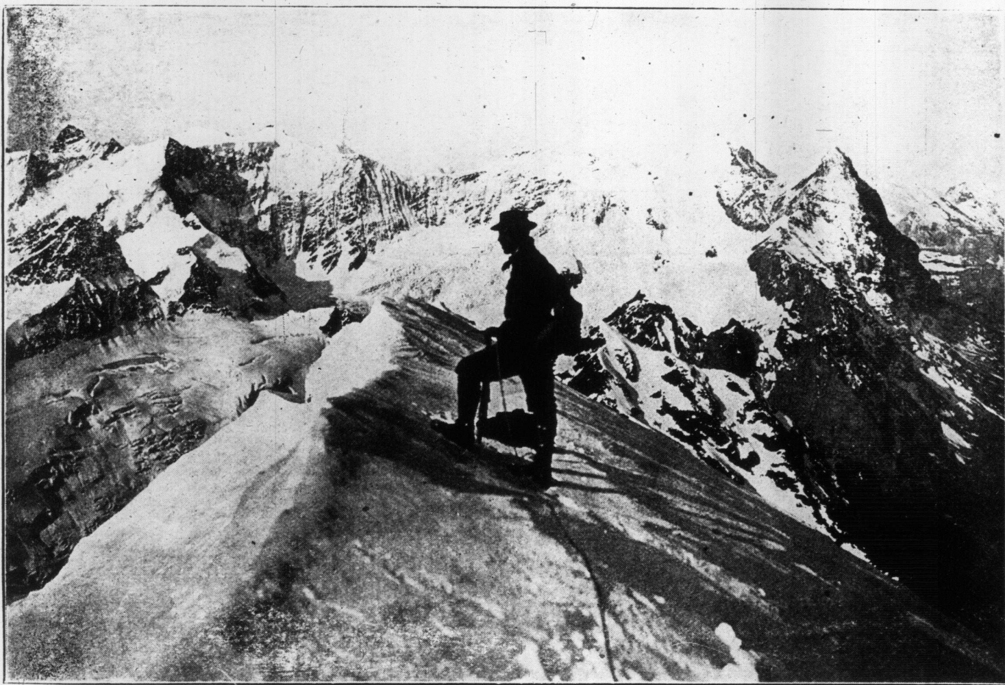
CLIMBING THE WETTERHORNE, ONE OF THE MOST DANGEROUS ASCENTS IN THE ALPS.