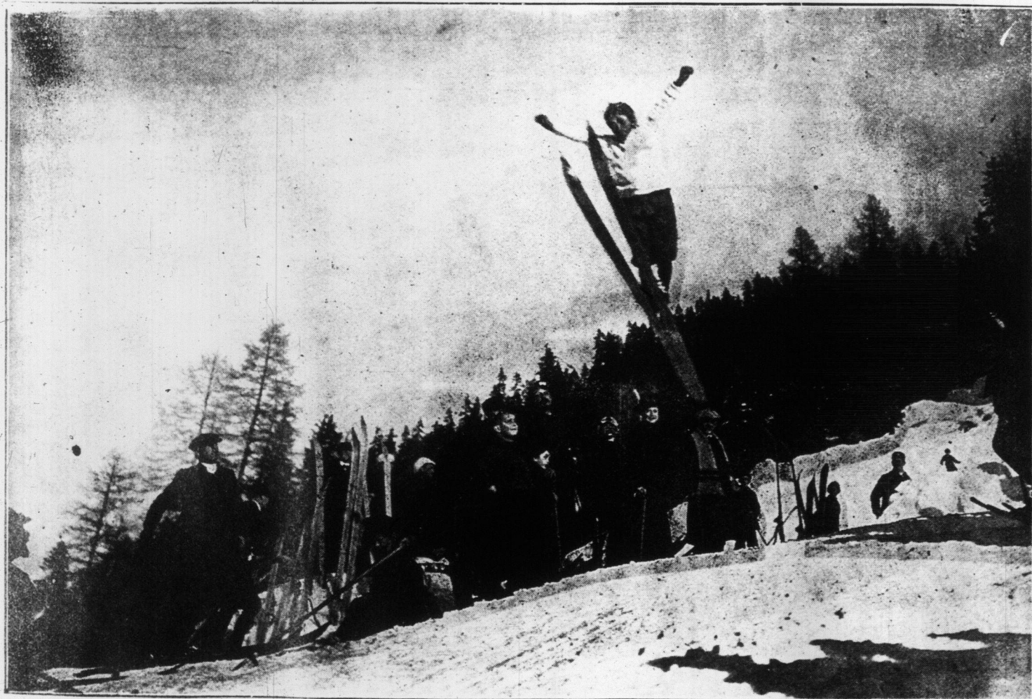
A BOY JUMPING ON SKIS IN DAVOS, SWITZERLAND.