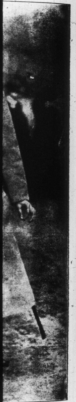
FIANCEE, PRIN- CE OF EMPEROR ED-WHILE TAK- ING IN BERLIN.