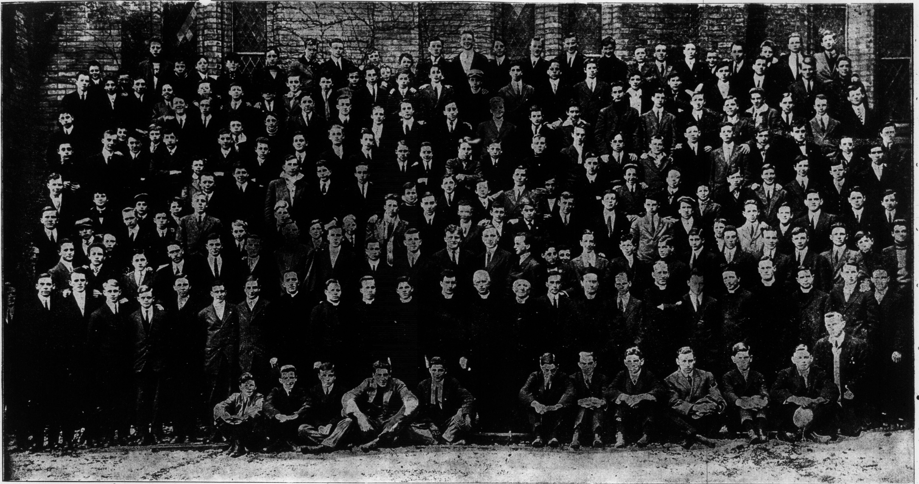
STUDENTS AND STAFF OF ST. MICHAEL'S COLLEGE.