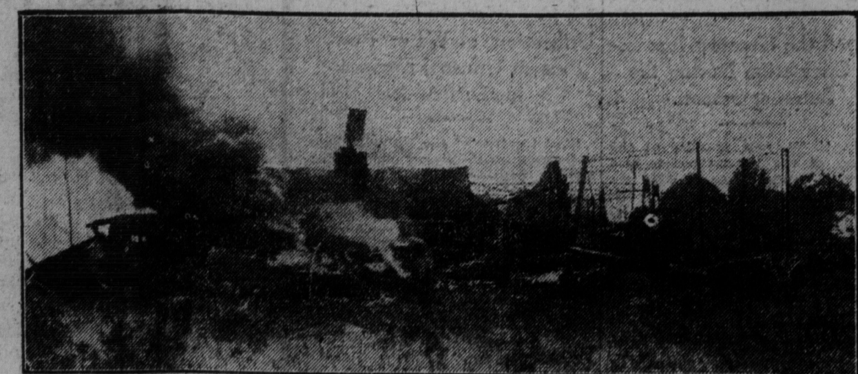
One Man Was Killed and Several Others Injured When New Boiler at Oshawa Gas Works Exploded Yesterday Morning. This Photograph Was Taken a Few Minutes After Explosion