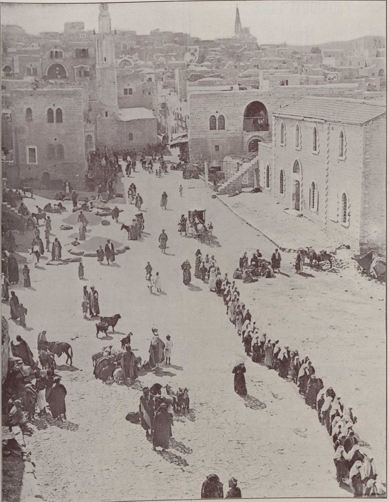
Bethlehem To-day The thoughts of all Christendom are turned towards Bethlehem at this glad Yule-tide season. It is now a village of some three thousand inhabitants. This picture, from a copyright stereograph by Underwood and Underwood, New York, was taken from the roof of the Church which stands on the site of the ancient inn, to which Mary and Joseph were denied admittance on the first Christmas Eve. The road from the lower town, up which they travelled, enters the square in the foreground, at the right side. A procession of Syrian Christians is entering the Church. Another picture of the Market Place at Bethlehem will be found on page 8, of this issue.