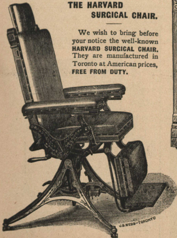
The Harvard in the upright position with head rest folded back.

We wish to bring before your notice the well-known HARVARD SURGICAL CHAIR. They are manufactured in Toronto at American prices, FREE FROM DUTY.