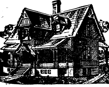
New Settlers AND NEW WANTED HOUSES

DIRECTIONS. —Send your full name, post-office address, County and State by return mail and you will be sent directions which will enable you to secure a villa or business lot, free; a ten acre orange grove tract, free; a loan of $1,000, free; and your travelling expenses to Ocala, free. NO CONDITIONS. —No charge for lots; no charge for orange grove tracts; no charge for deeds; no charge for $1,000 loan; no charge for a free trip to Ocala. The Ocala & Silver Springs Company has a Capital of $1,000,000 and owns or controls large hotels, houses, high-grade 8 per cent. guaranteed dividend securities, real estate, and other properties in Ocala and vicinity, aggregating in value $2,025,600. OBJECT. —The Company is giving away one-half of its villa and business lots, and one-half of its orange grove tracts for common-sense business reasons. Experience has proved to us that the majority of those accepting free deeds for these properties will build homes, when a $1,000 loan is made to them, and engage in business, and thereby quadruple the value of their own lots, as well as those reserved by the Company. Our plan of town-building is a great success. The population of Ocala has increased during the past four years from 2,000 to 6,500 people. This offer may not appear again. Write to-day. It costs nothing for postage—we pay that. Agents wanted at $100 monthly salary.