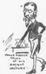
HON. G. E. FOSTER

session, in the second place, and the people had been appealed to by the Auditor himself, in the third place. Are we never to pass on to anything new? Why does not the Opposition bring forward some substantial reform that will attract the attention of the electors? Do they expect to listen with continued patience to Mr. Foster's charge that the East Atlantic service had not been established during the