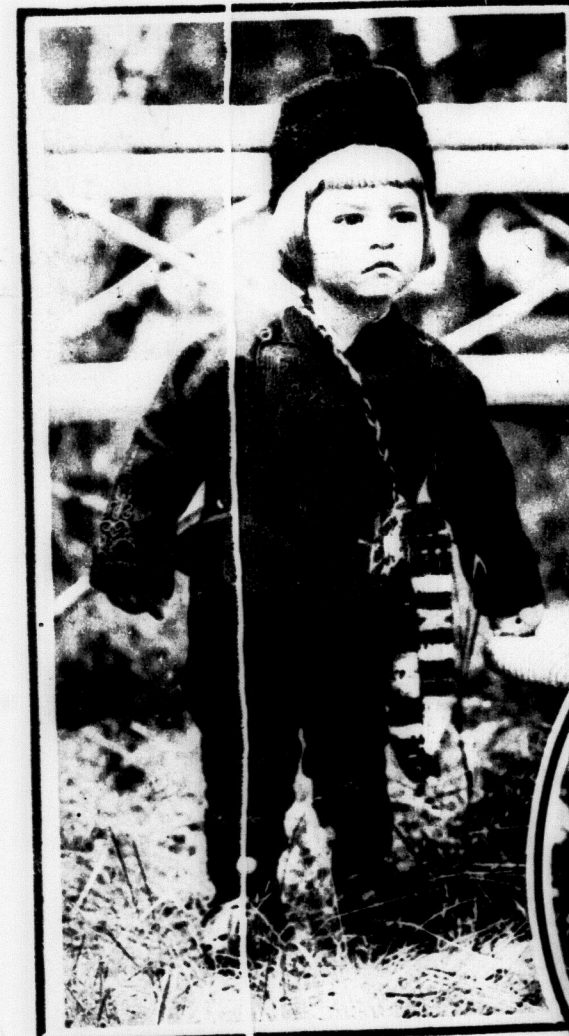
The world's youngest crown prince—Peter of Serbia—on his second birthday