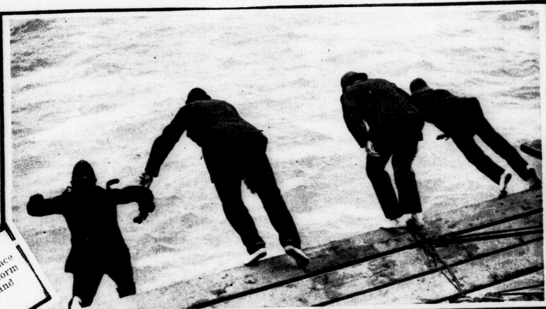
Start of a swimming race for policemen in uniform at Brighton, England