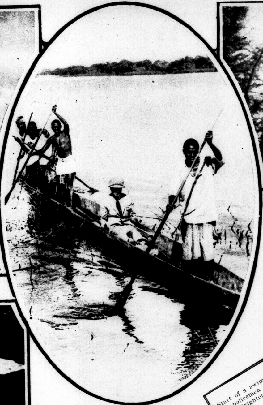
The Prince of Wales riding in a native dug-out on the Zambesi river, South Africa