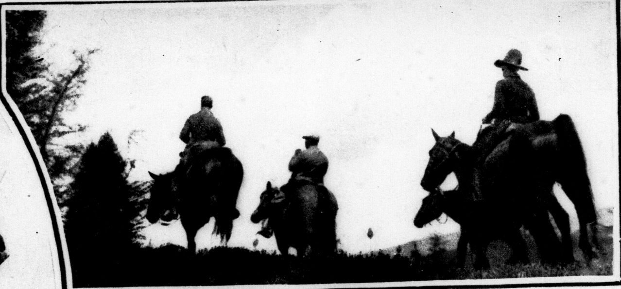
On the summit of Wolverine Pass. These riders are breaking a new trail from Marble Canyon to Lake Ottawa