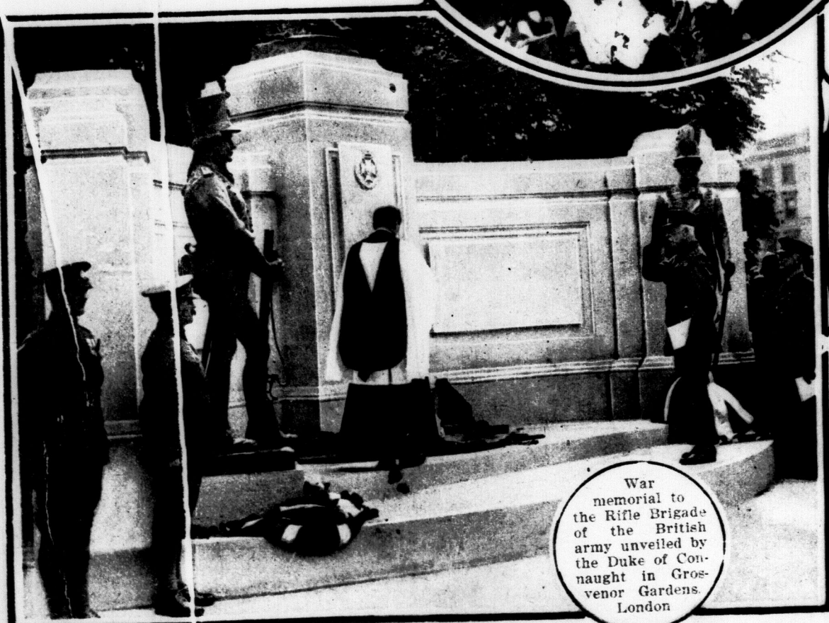
War memorial to the Rifle Brigade of the British army unveiled by the Duke of Connaught in Grosvenor Gardens, London