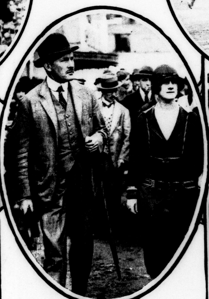
Prince and Princess Arthur of Connaught, visiting Luna Park, London, where an entertainment was held to assist a hospital fund