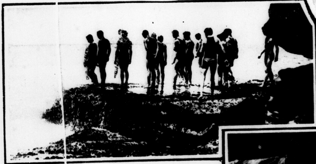
Nature's shower bath at Clovelly, New South Wales, where waves shoot high on the rocky shore