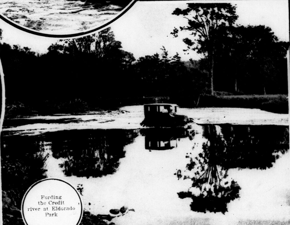
Fording the Credit river at Eldorado Park