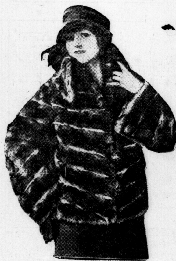
Long current rumors from fashionland have at last become definite and we are told that the fur jacquette, so popular during the winter, will continue to be very much in vogue till summer sets in. The one shown above reaches to the hips with high collar and sleeves cut mandarin fashion.