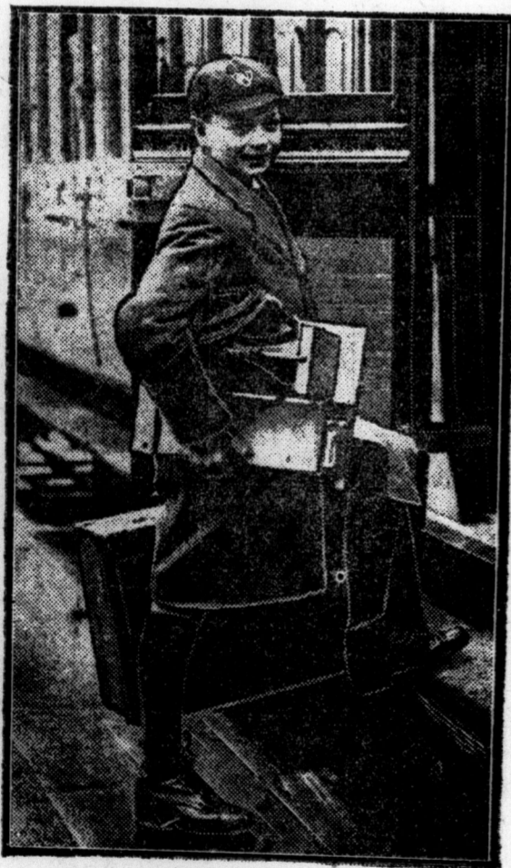
An English youngster taking his radio set to school with him. All England is very much worked up over the question of wave lengths, broadcasting records and other similar topics.