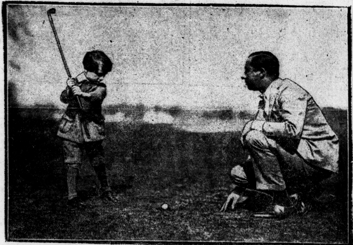
Walter C. Hagen, Sr., British open golf champion, instructing his five-year-old son in the correct way to become a golf champion.