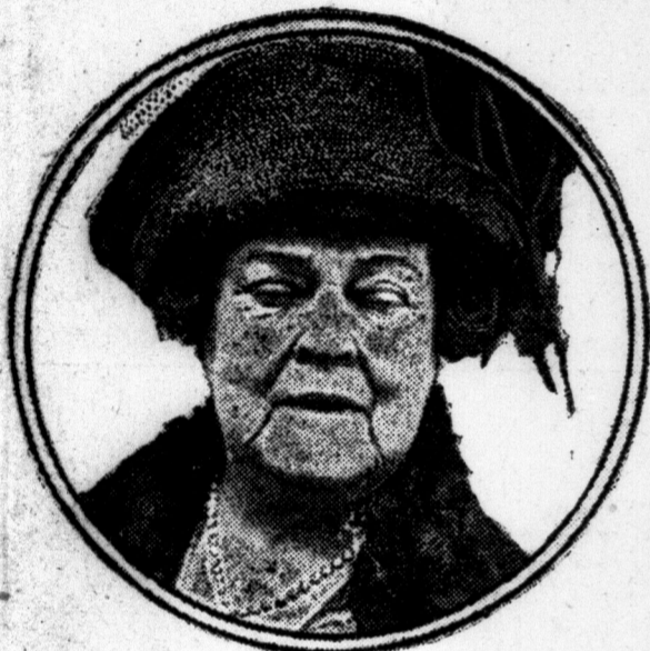
Mrs. O. H. P. Belmont, well-known New York society leader, expects to start lecturing all over everywhere on behalf of the National Woman's Party.