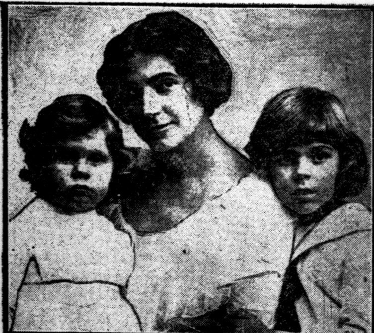
Mrs. Max Reinhardt, famous continental actress, who is now on her way to America, is being sued for divorce. She is shown here with her two children.