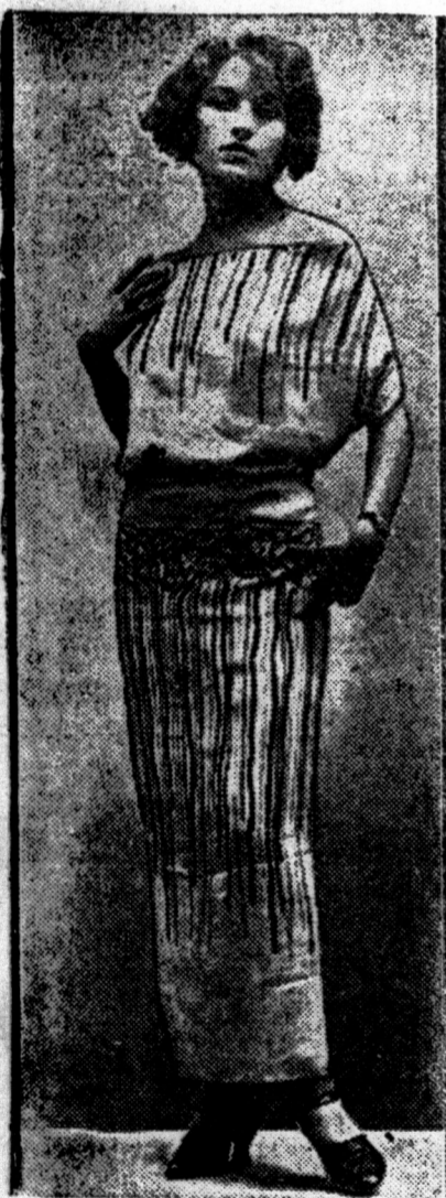
The latest style from Paris is the printed dress. It is usually very elaborately done and is considered just the thing for afternoon wear.