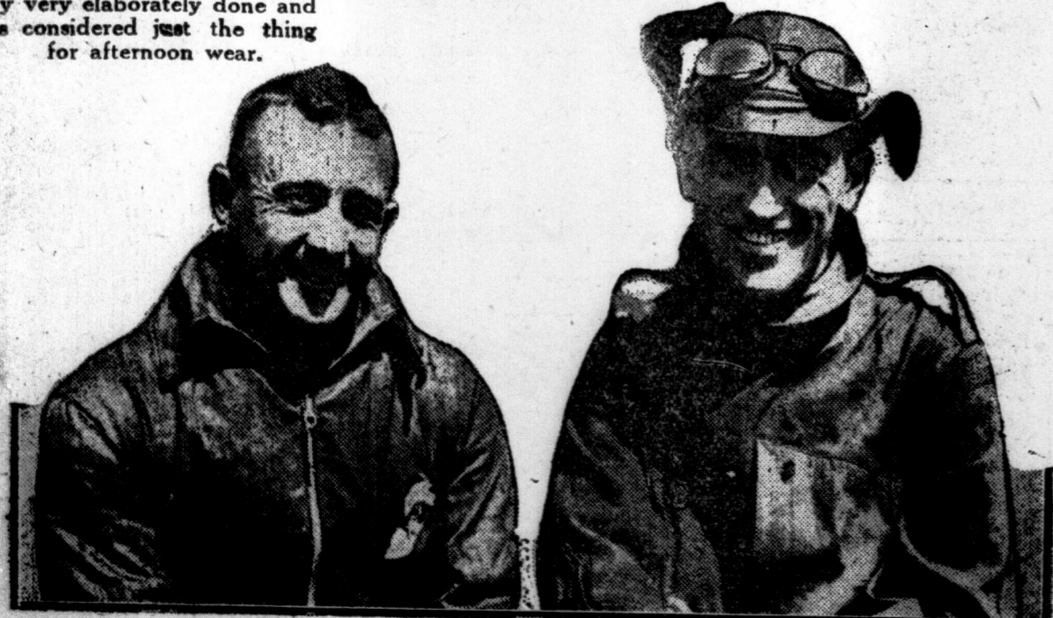
Lieuts. Oakley Kelly and John A. Macready made new endurance and distance records in a recent flight at Dayton, Ohio. They were in the air for 36 hours and five minutes and covered a distance of 2,094 miles.