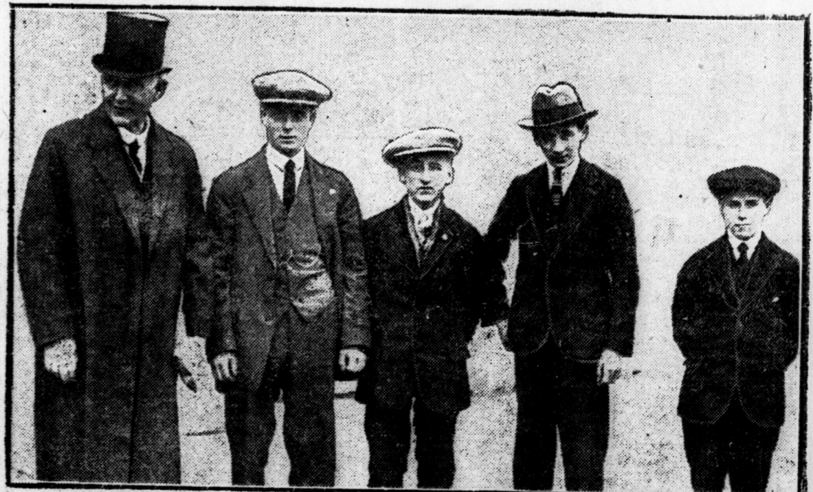
A deputation from the British Y. M. C. A. about to visit Buckingham Palace. They are presenting the Duke of York with a gold hunting crop as a wedding gift.