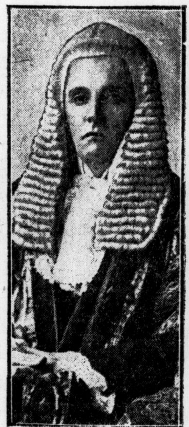
Lord Birkenhead, Lord High Chancellor of the Empire, who is expected to pay a visit to Canada during the latter part of August.