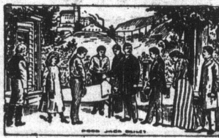
SCENE FROM ACT II.