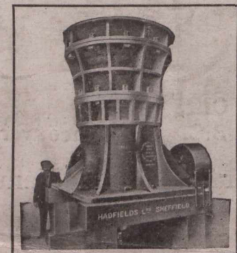
'HECLON' ROCK & ORE BP TER