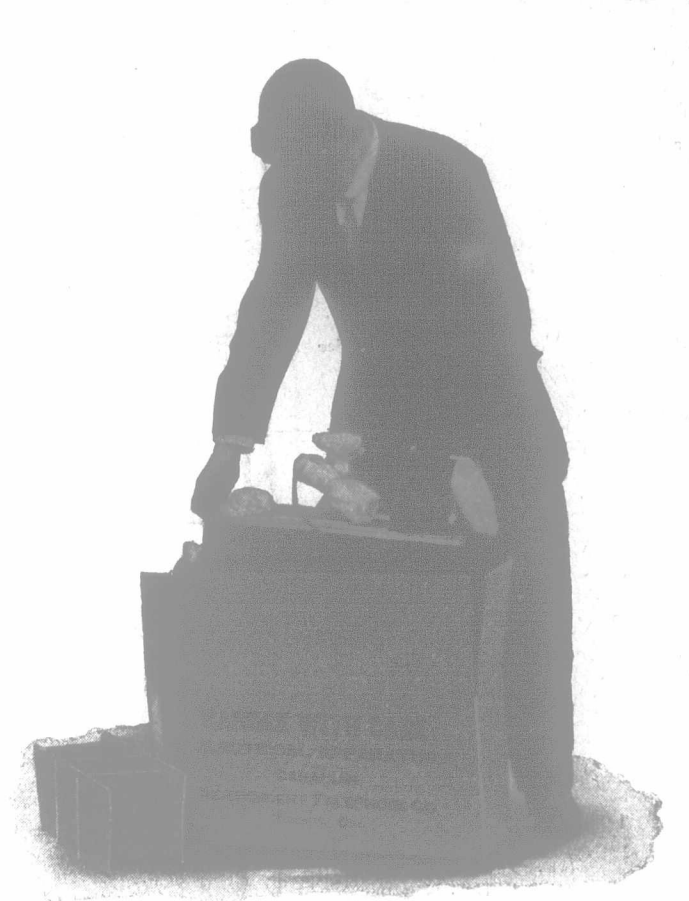
Every telephone in a separate case, ready to go on the wall.

Every CANADIAN INDE-PENDENT TELEPHONE has receiver, transmitter and shelf already attached. No time is lost in assembling parts. Nothing to do but connect up the batteries and snap on the hook-switch.