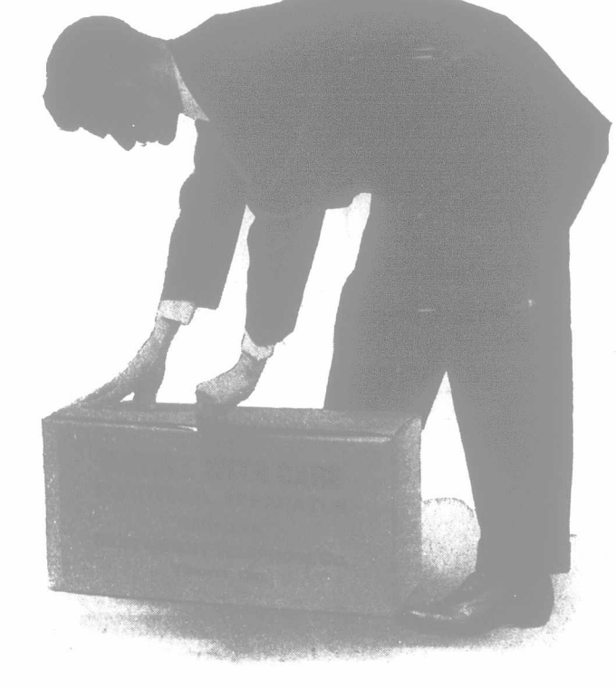
No nails to be removed or screws to be drawn. Simply cut open with a jack-knife.

Of course, you are interested in telephones, or you wouldn't be reading this ad., so send for our up-to-date telephone bcoklets. And, remember, that we carry large stocks of construction materials and fill orders promptly.