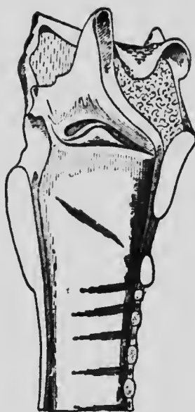
Vertical section of the Larynx as seen from the side.

The larynx may be considered as the guard-house of the lungs, —admirably adapted to protect them from injury. It consists essentially of a box, surmounted by a movable lid, called the epiglottis, which closes during the act of swallowing, to prevent food from