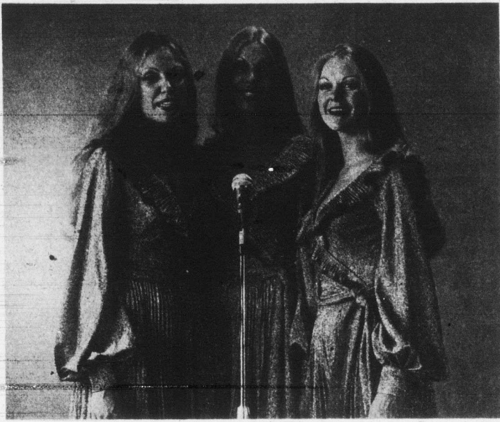
The Peaches, these three singing sisters, are part of the new swinging scene in the Constellation Hotel's Woodbine Inn. A new menu and the voices of these three recording stars has made the Woodbine Inn a popular spot for dining, dancing and just plain listening.