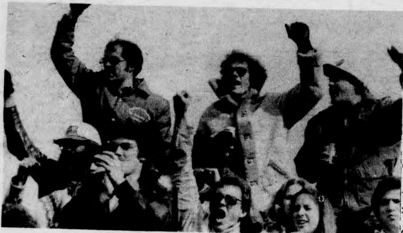
Alumni raise some school spirits.