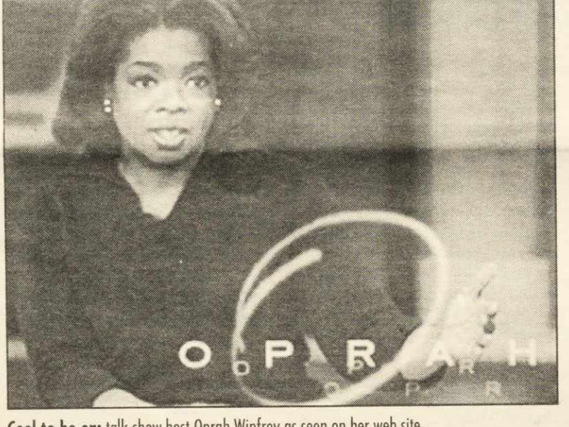
Cool to be on: talk show host Oprah Winfrey as seen on her web site