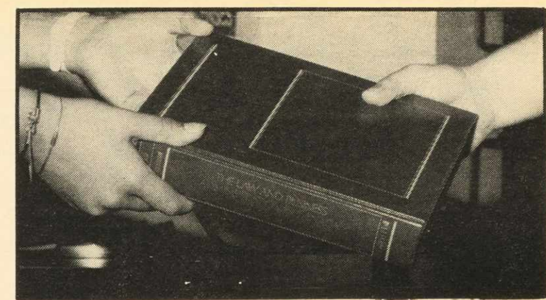
Suzan Ketene; Dal Photo

"The earliest that change can be implemented is January '86," she says.