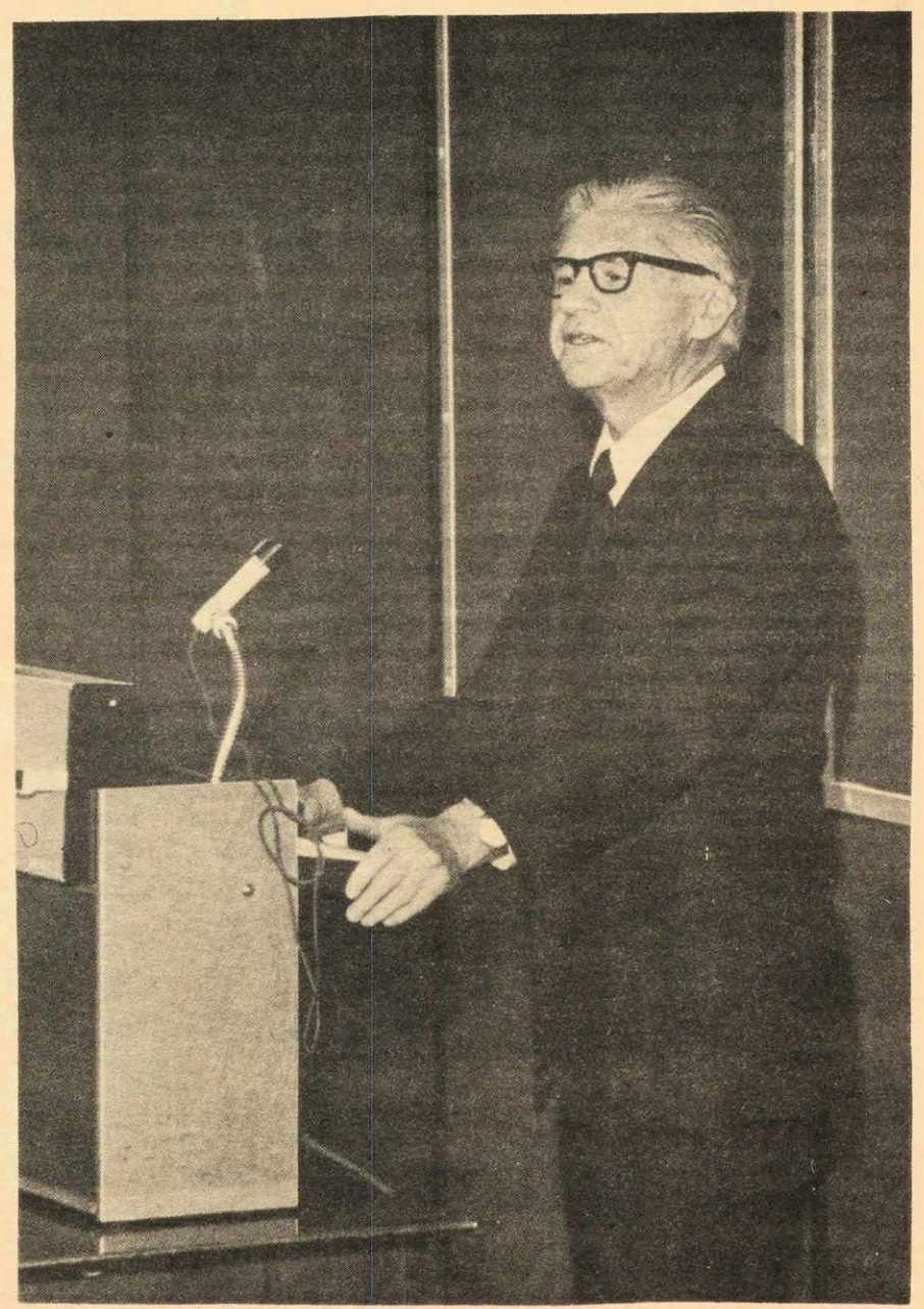
M.H. Abrams speaking on the new, new criticism

To what does 'She' refer? Abrams is sure 'She' is a lady—maybe Lucy of the preceeding Lucy poems, but he is also sure that the other interpretation will continue to exist. There are no definites in this field, "we hit finally the bedrock; we can go no further." Then it becomes a matter of choice—choice determined by literary criteria and