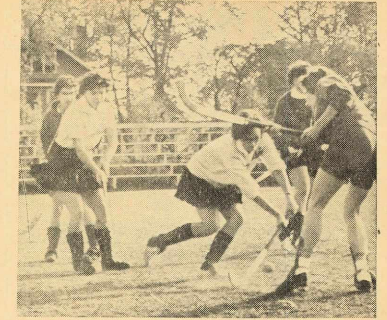
WATCH MY SHINS — Shown above is some of the rugged action that featured Dal's best field hockey game of the year. The Tigerbelle tied the Axettes at 2 all in last Wednesday's game.