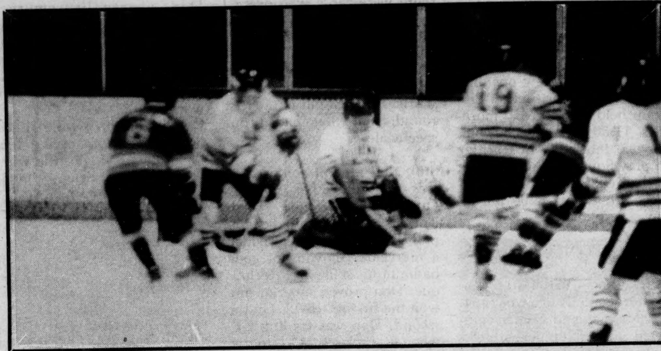
The secret to the Blazers wins are not giving up rebounds.