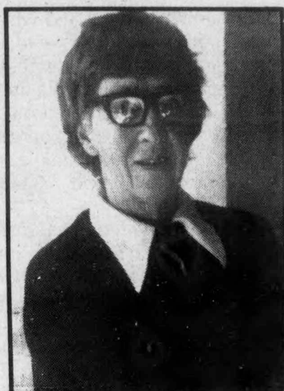
Molly Lamb Bobak, well-known Canadian artist, will be awarded an honorary Doctor of Letters degree at that ceremony and will address the graduates.

Education program and the four-year Bachelor of Education program.