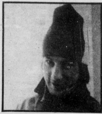
Rock Vallee Arts 4

It's alright. It's better for your health not to. But it depends what you smoke.