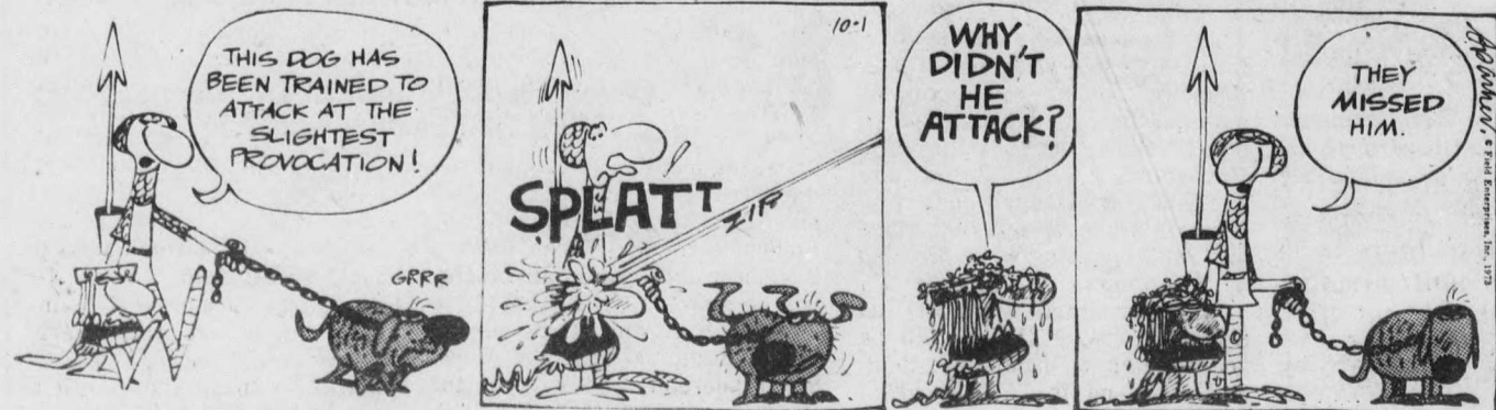
by Brant parker and Johnny hart