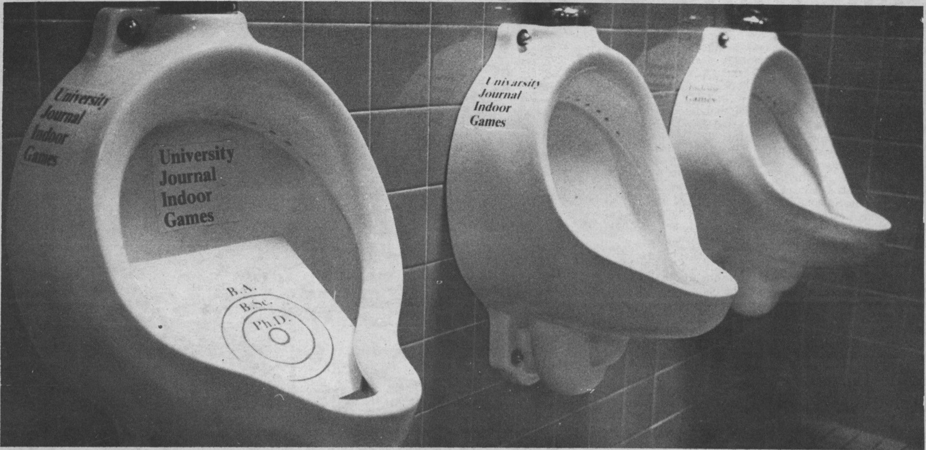
The equipment is in top shape. Inferior equipment can cause serious injury.