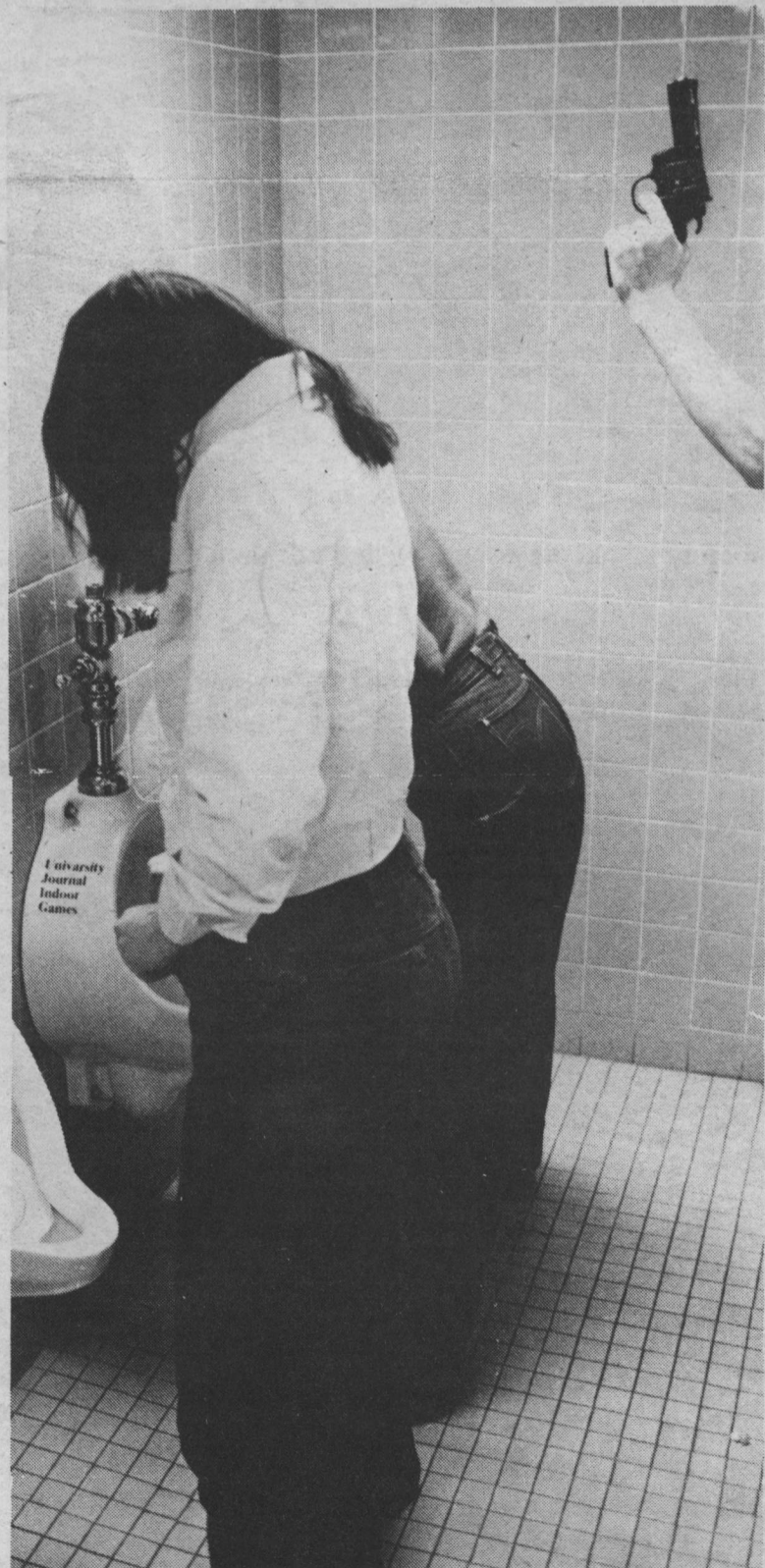
The competitors hang loose, but as action photog Brian Grabalot shows, competitors are missing vital parts and foul out.