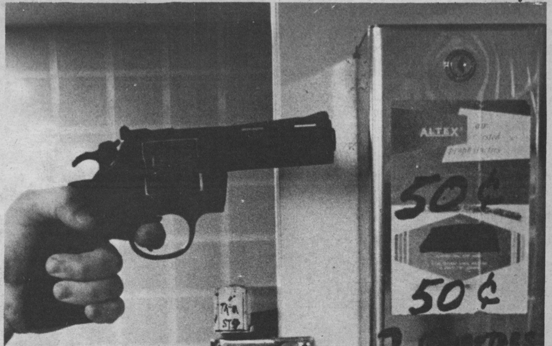
Not even competition 7-ply condoms can take this kind of abuse.