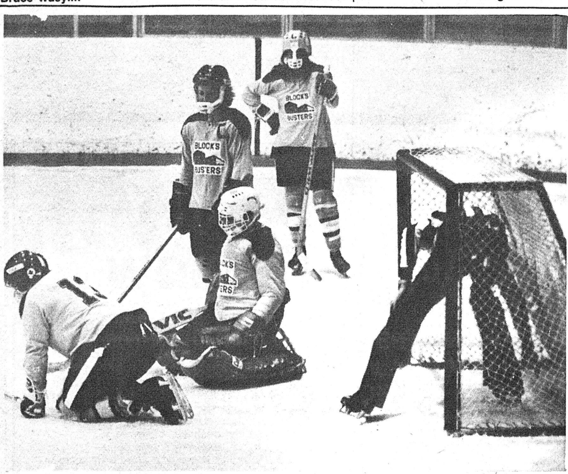
Well what the.. A dejected and demoralized band of women hockey players re-evaluate their reasons for taking up the fun sport of hockey. The team from Drayton Valley were humbled by the Alberta Kodiaks Saturday night, 8-1, at Varsity arena. Cheer up girls, there's always next weekend.