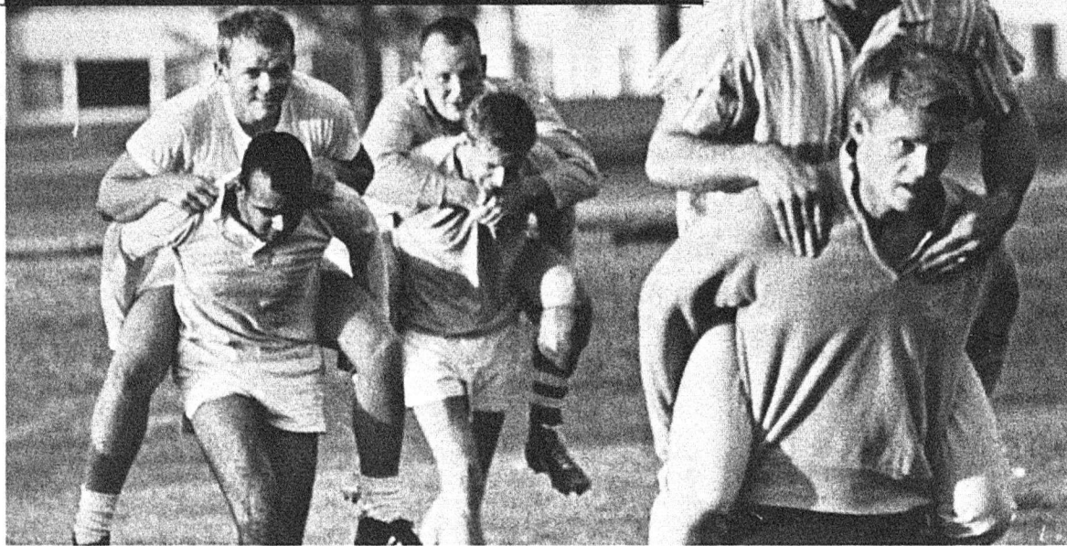
WOULD YOU BELIEVE—RUGGER ... part of the conditioning