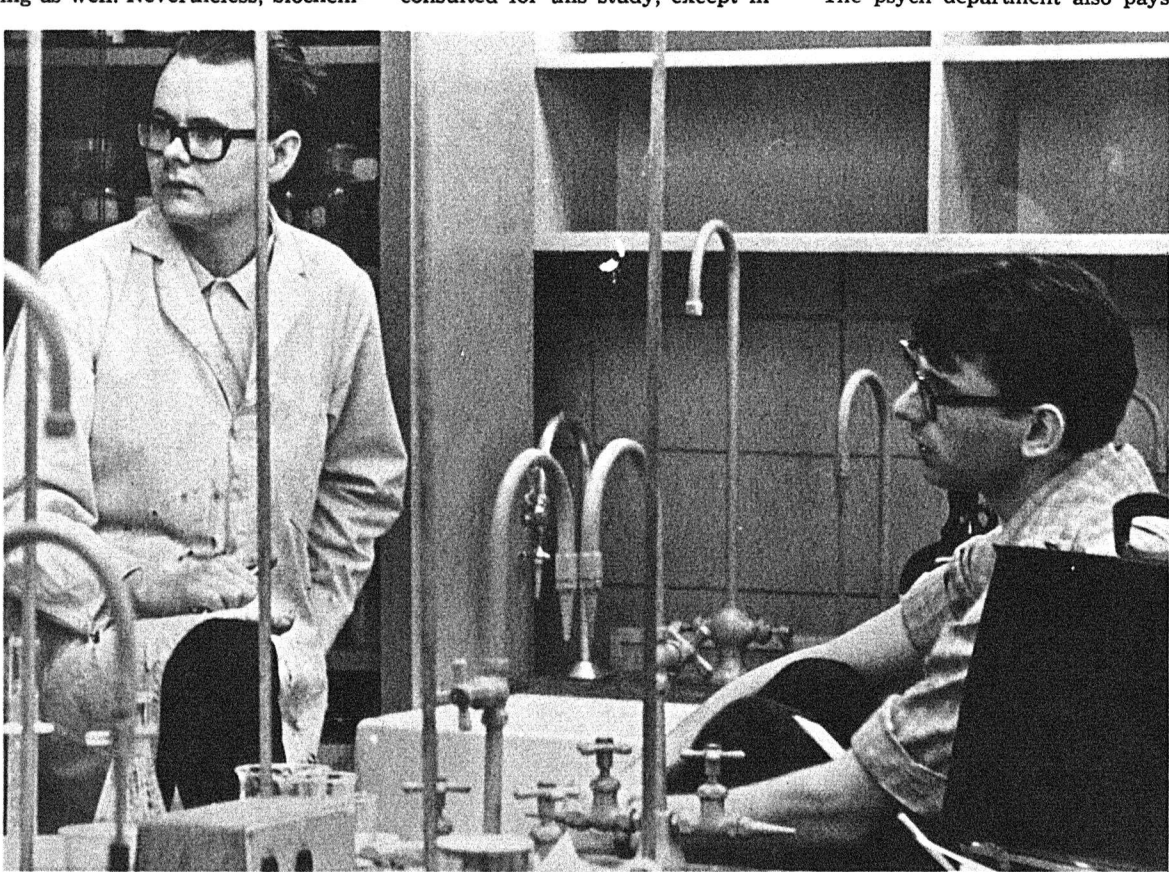
HONEST SIR, I DON'T KNOW WHY IT BLEW UP ... the helpful TA shows student the error of his ways

members without exception. Although they are rare, there have been cases where a student has had a grievence against a TA. In such a situation, all department officials said, the student should not hesitate to seek out other people in the department or faculty — even the dean. Such ocurrences are infrequent, however, and it has been noted that the TA's sometimes establish better rapport with their students than do older members of the department, especially where freshmen classes are concerned.