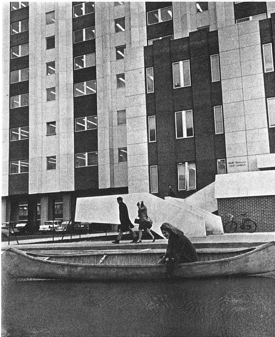
YOU'VE GOT TO OAR FASTER —Arlene Hanocho, arts 3, tries vainly to navigate across the now infamous Tory Lake. It is rumoured that when sub-zero weather descends on Edmonton the lake will be fenced off and used as a public skating rink.