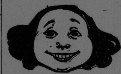
The Pyramid Smile.

Instant Relief, Permanent Cure—Trial Package Mailed Free to All in Plain Wrapper