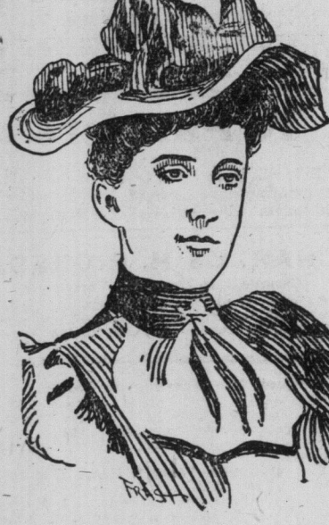
H. R. H. Princess Aribert.