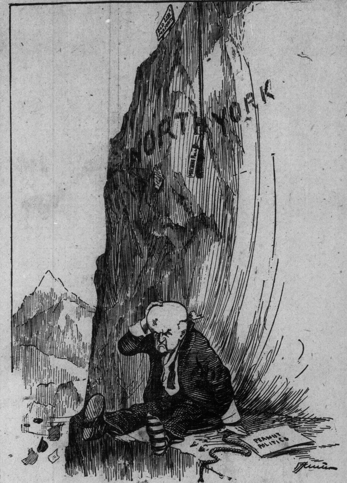
THE FARMER'S SON: But I've got there just the same.