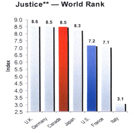
Source: IMD * Confidence that person and property is protected. Rank among 60 economies considered in the 2014 World Competitiveness Yearbook. **Degree of fairness of the judicial system in Society. Rank among 60 economies considered in the 2014 World Competitiveness Yearbook.

Canada is a G-7 leader in terms of the safest place to live and to conduct business under a fairly administered judicial system.